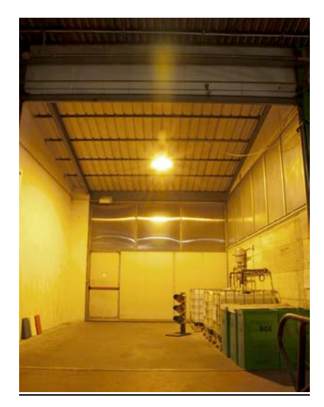
Warehouse lighted with discharge lamps. The shadows are more pronounced.

The technical innovation has lead to a radical change in lighting systems, due to the introduction of new LED systems and, consequently, of new lighting fixtures. With the same luminous flux, the new LED systems have the advantage of absorbing an amount of energy some times up to 70% less respect to the energy required with use of lighting fixtures with traditional or fluorescent lamps and, not least, a feeling of lighting more pleasant to the human eye.