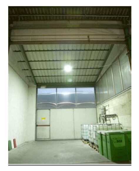
Warehouse illuminated with LED lamps. The illumination, at the same luminous flux, is more pleasant and shadows less accentuated.